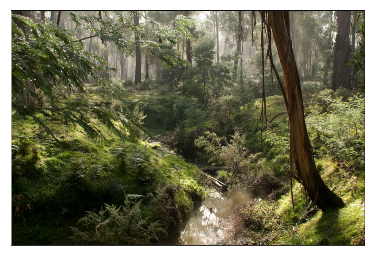
Confluence of Watsons and Stevensons Creek

The map on the following page shows the catchment