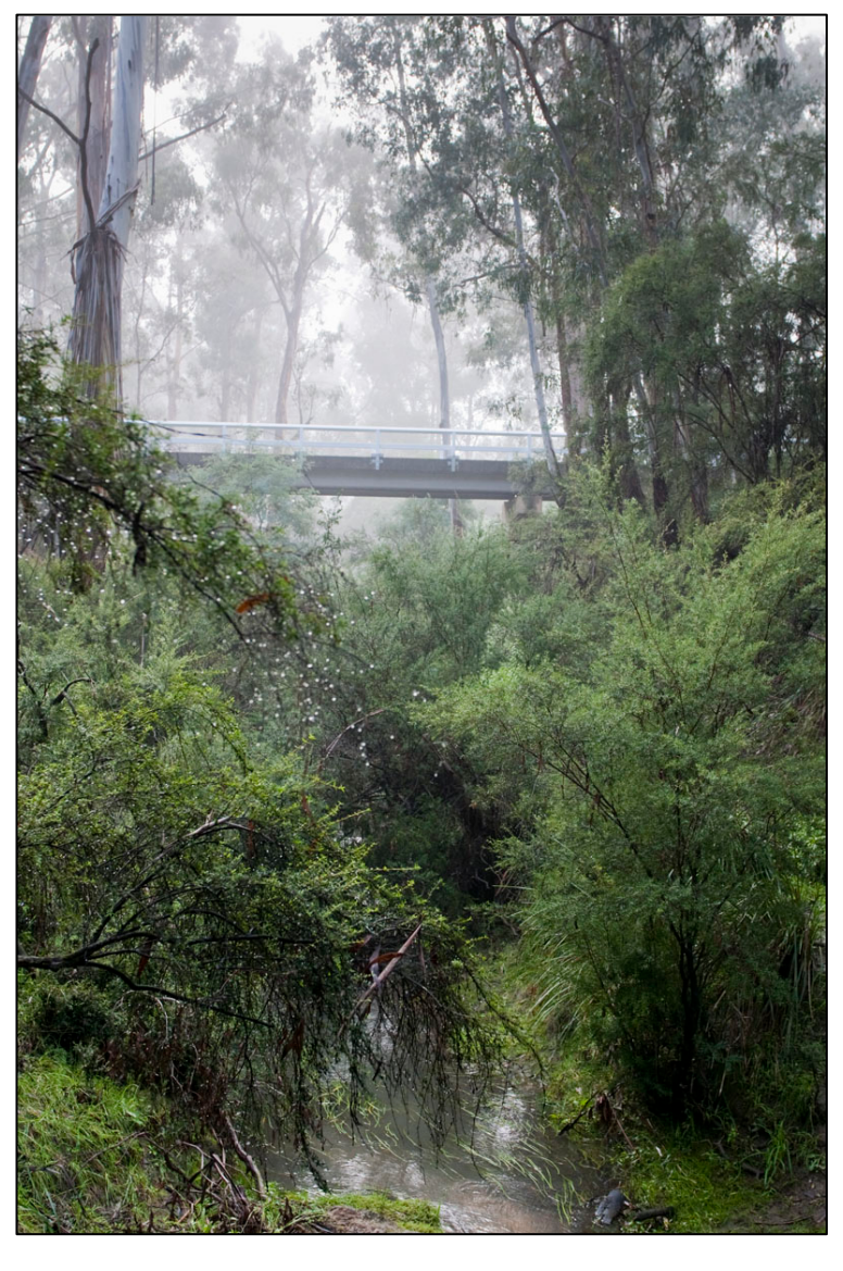
Watsons Creek at Kangaroo Ground

Bans are implemented or lifted when a catchment-specific trigger has been met, based upon the seven day rolling average stream flow.