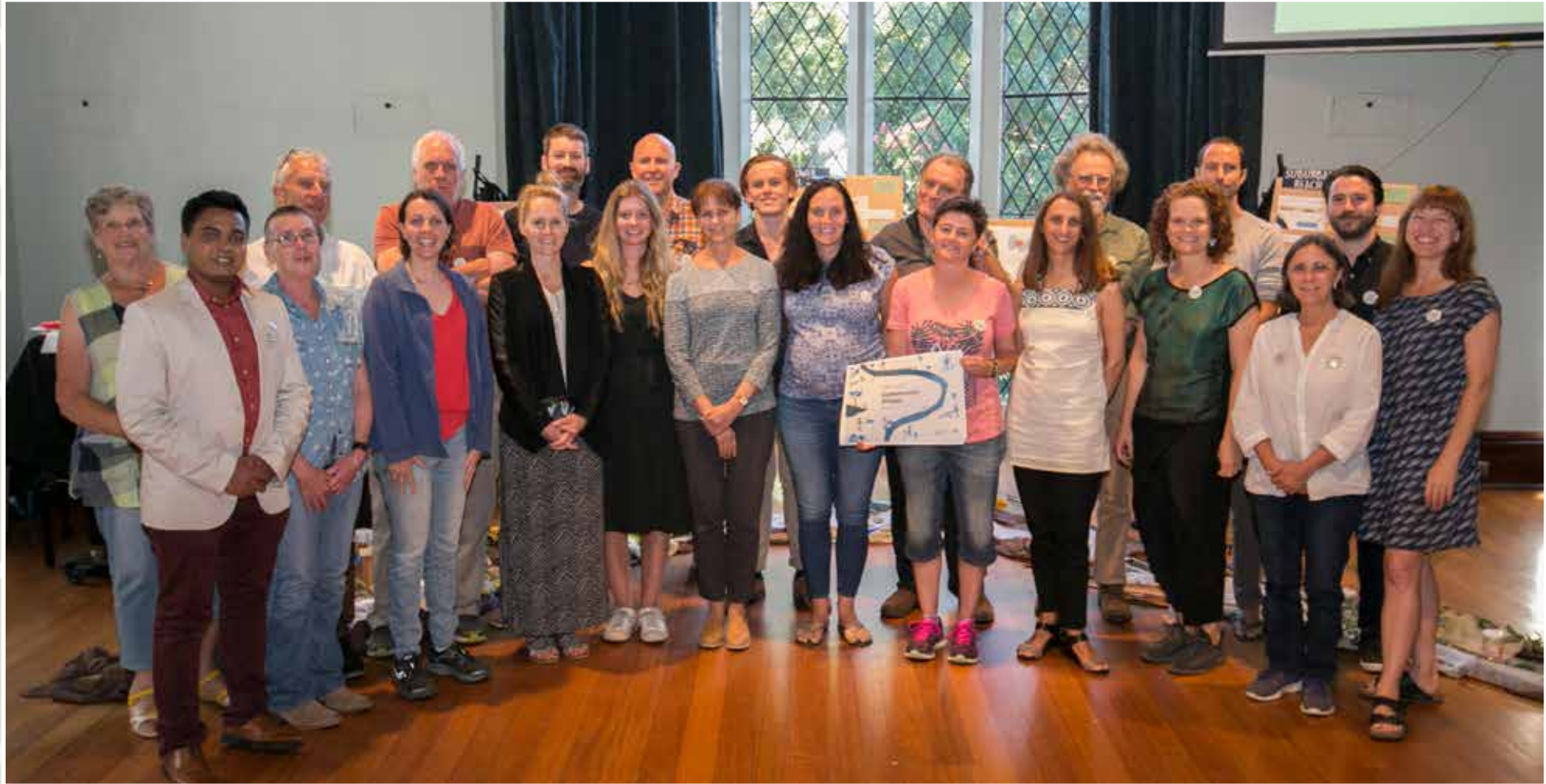
Community Assembly Members