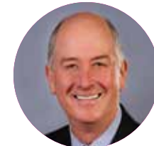
The Hon. Lisa Neville MP Minister for Water