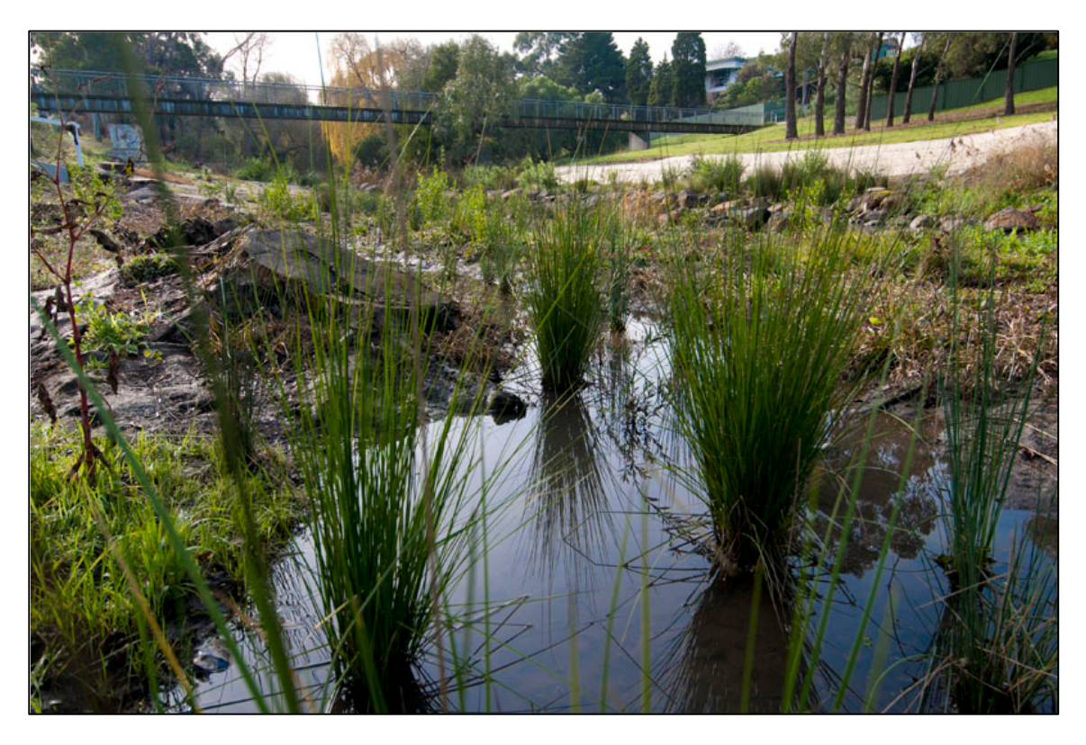
Merri Creek revegetation works

Active licence holders in the Merri Creek with allocations greater than 5ML are metered by Melbourne Water.