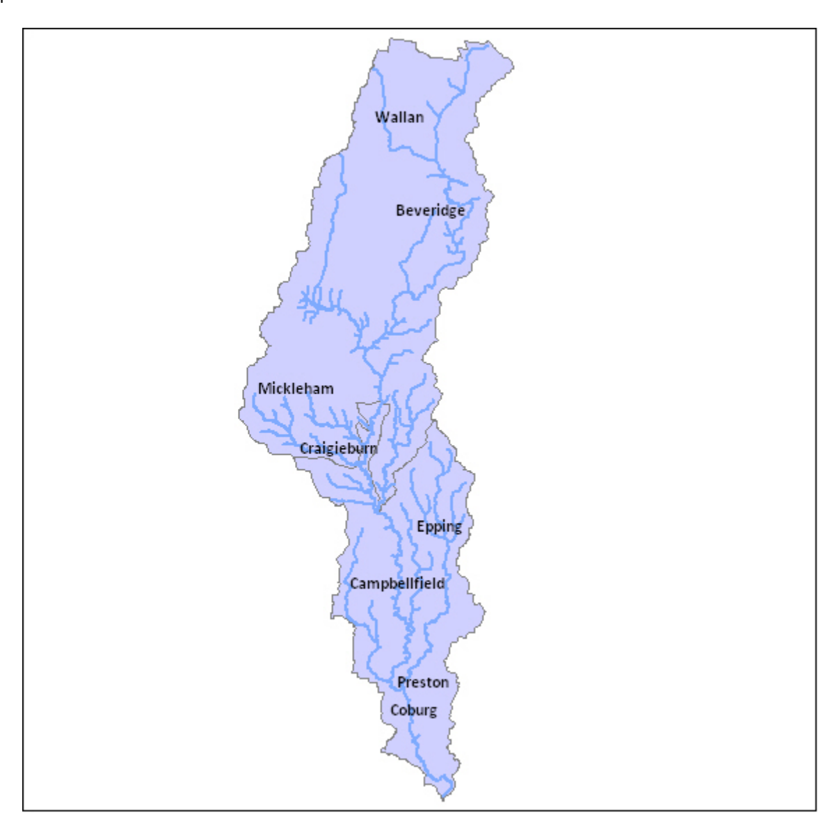
Merri Creek Catchment