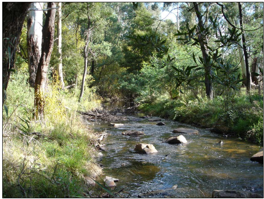
Little Yarra River