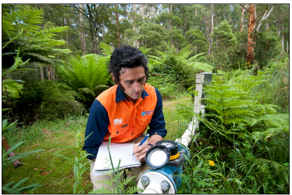
Irrigation meter being read by Melbourne Water