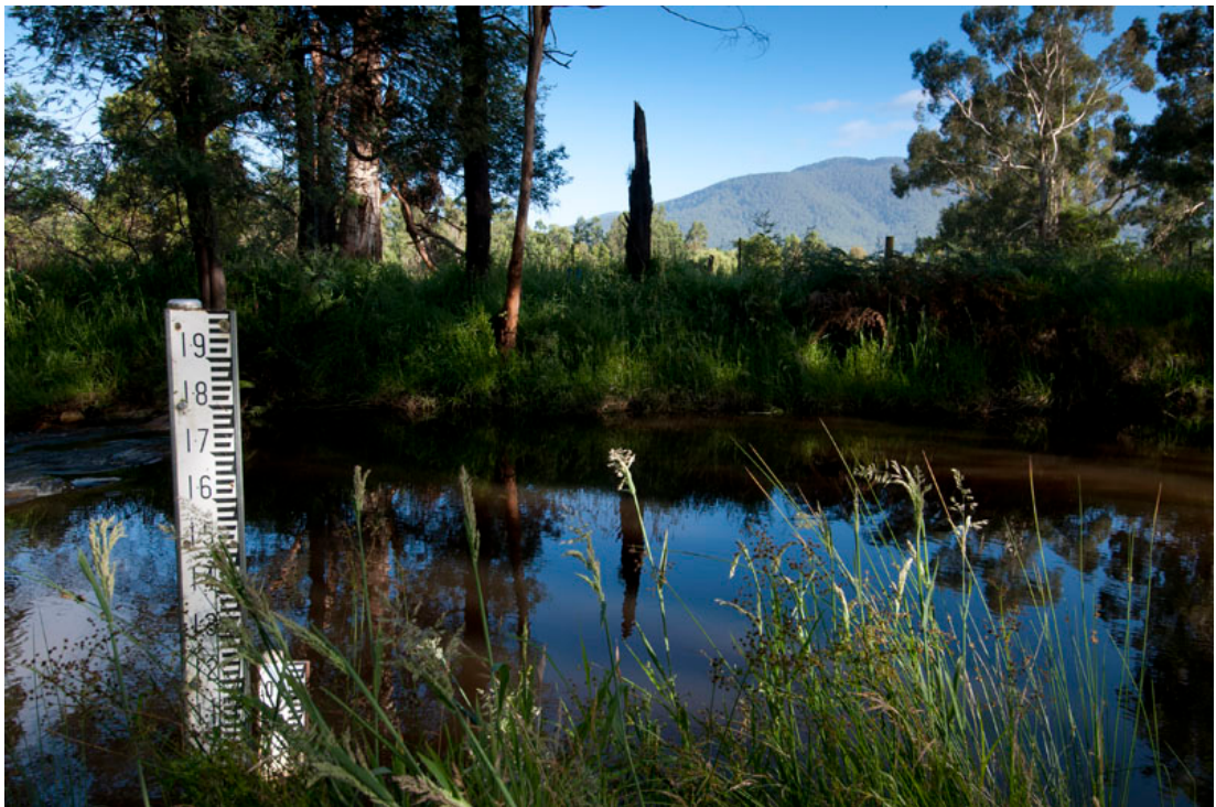
Little Yarra River flow gauge at Yarra Junction