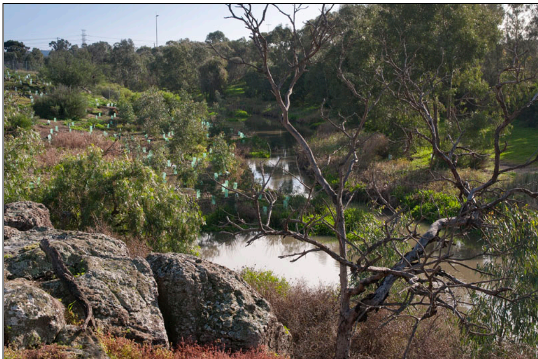
Kororoit Creek at Altona

The map on the following page shows the catchment: