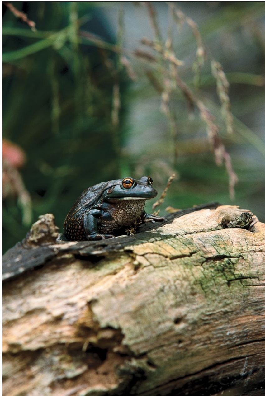
Growling Grass Frog