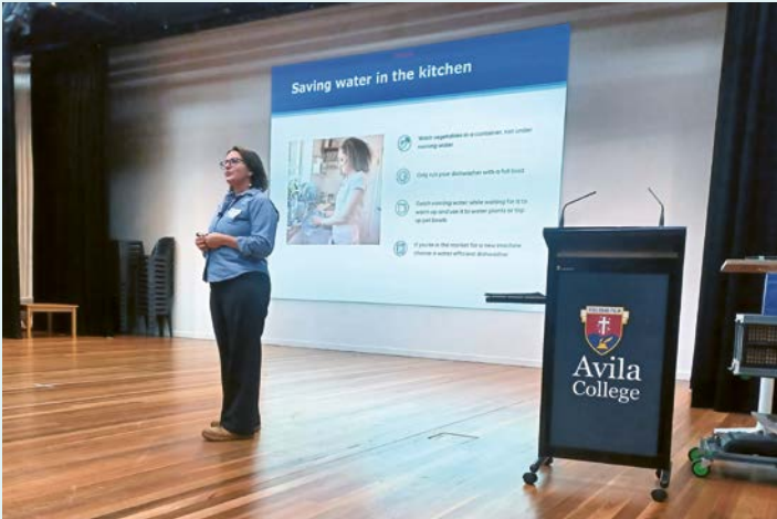
Water literacy incursion at Avila College.

Throughout the project we identified opportunities to engage with the local community to ensure their interests were respected. As part of our commitment to restore the natural landscape, we worked with Friends of Damper Creek and Friends of Scotchman’s Creek groups and planted over 1,000 grasses and herbaceous plants. We also worked with the Waverley Community Learning Centre to educate the students on Melbourne Water’s water and sewer network, including an excursion to the Western Treatment Plant in Werribee. The team also delivered water literacy sessions to Avila College’s year 7 science students.