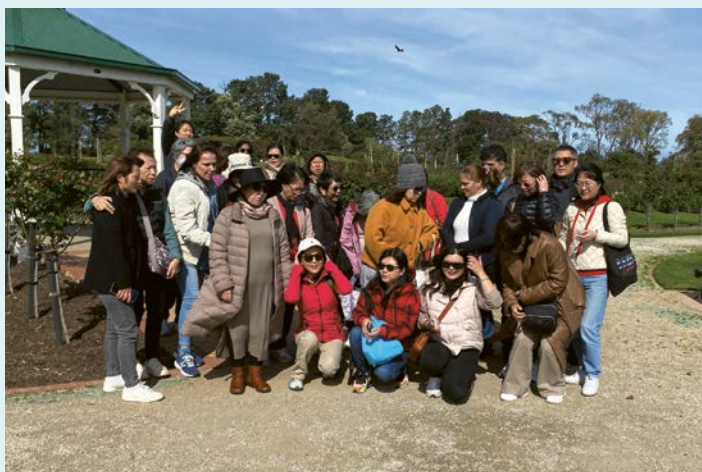
WCLC students on excursion to Werribee.