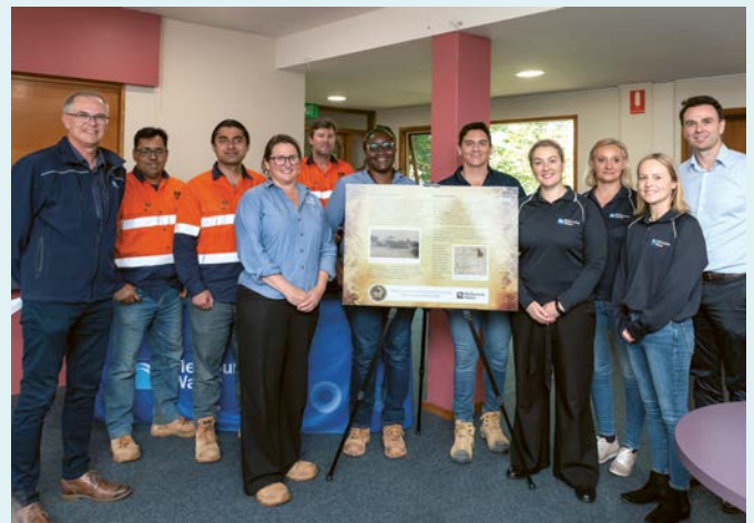
Melbourne Water and SFP JV project team at the unveiling of the Waverley Historical Society sign.

We could not have completed this essential water main renewal project without these strong partnerships.