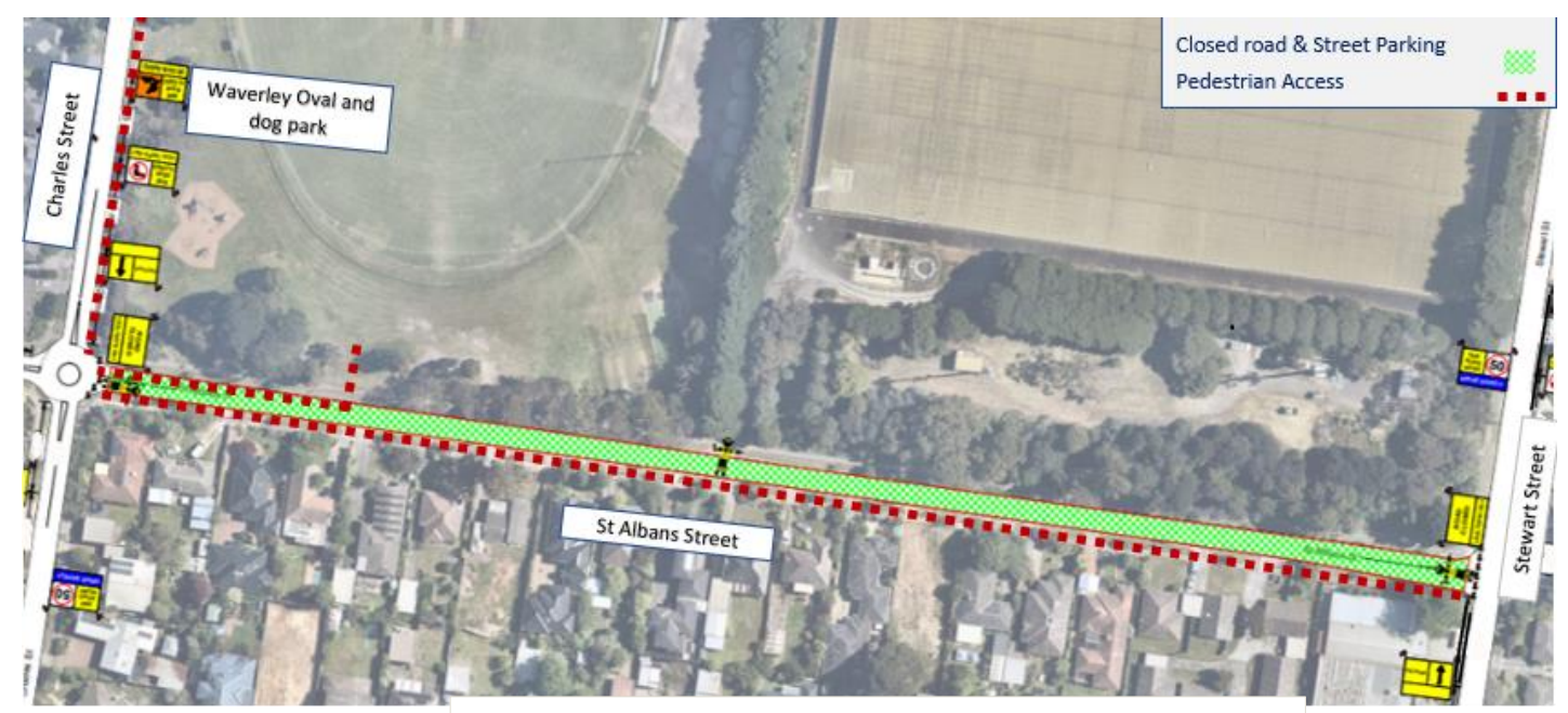
Figure 2: Traffic detours on St Albans Street

Access : There will be no right/left turn into St Albans Street from Stewart Street and Charles Street.