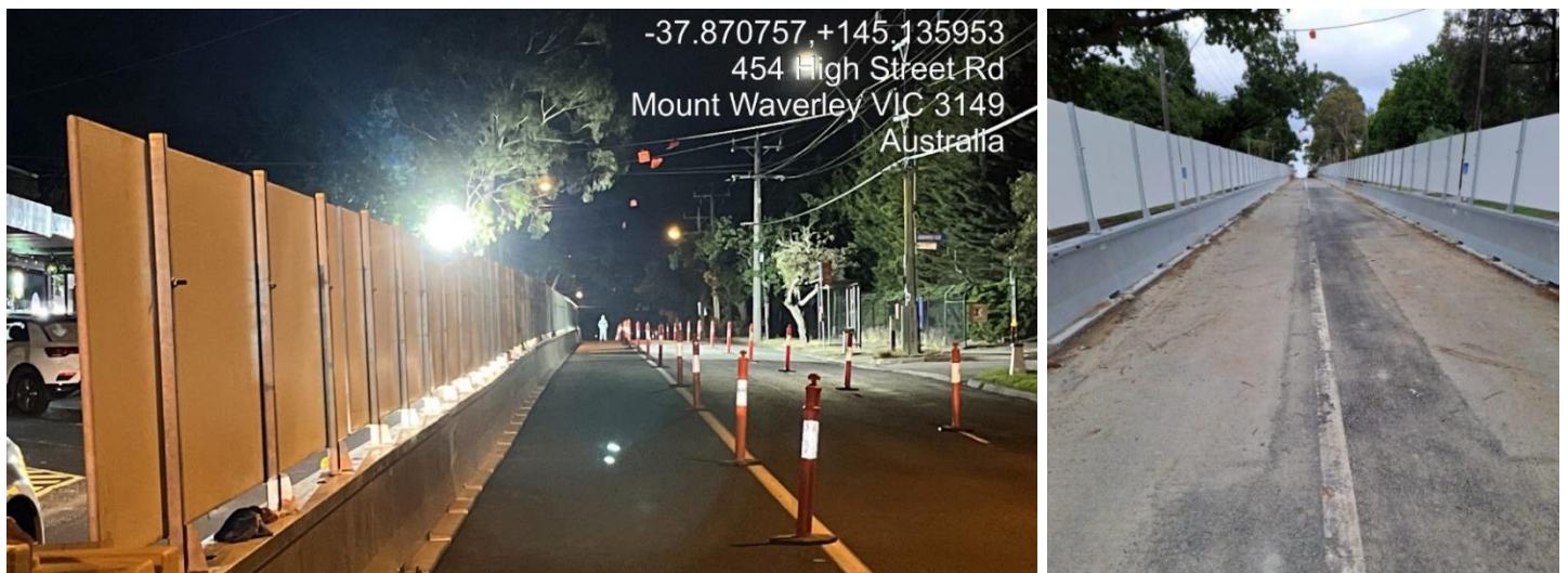
Figure 2-3: Barrier install works at night and barriers on High Street Road

To ensure the safety of commuters, bus stops within the work site area will close until it is safe to re-open. Please use neighbouring bus stops during this time.