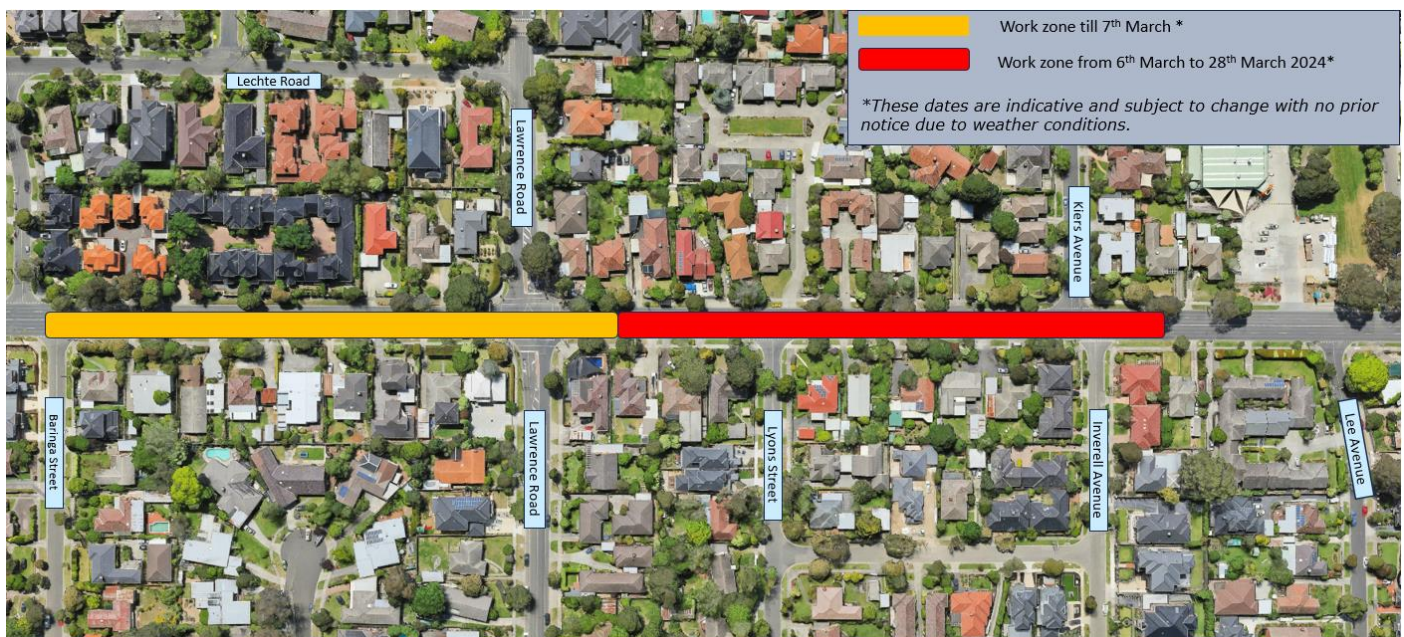
Figure 1: Work area for barrier movement and installation

Time: 10pm – 5am (overnight works on both dates)