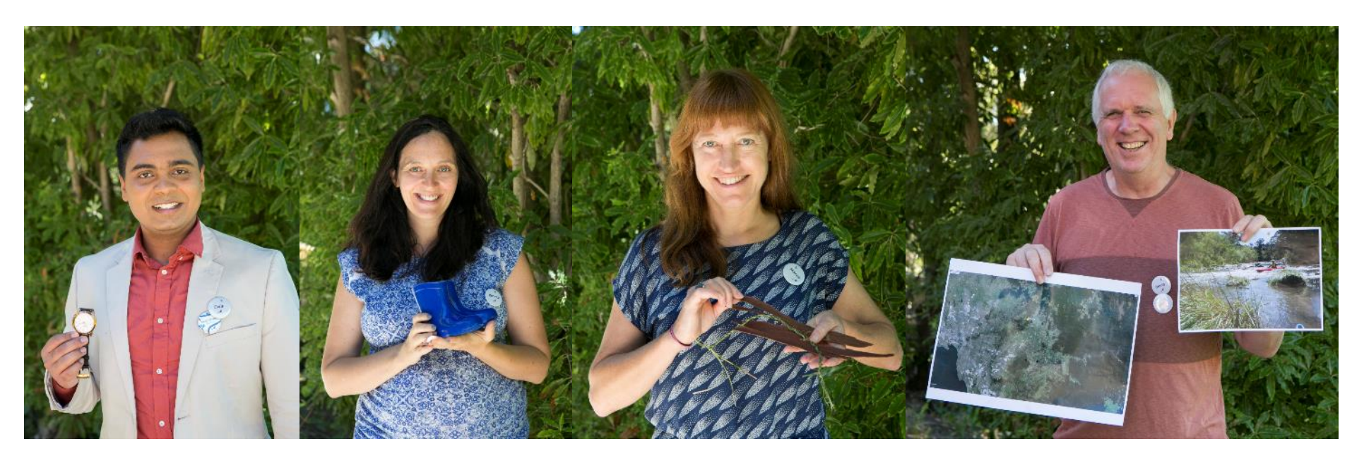
Members of the Yarra River Community Assembly