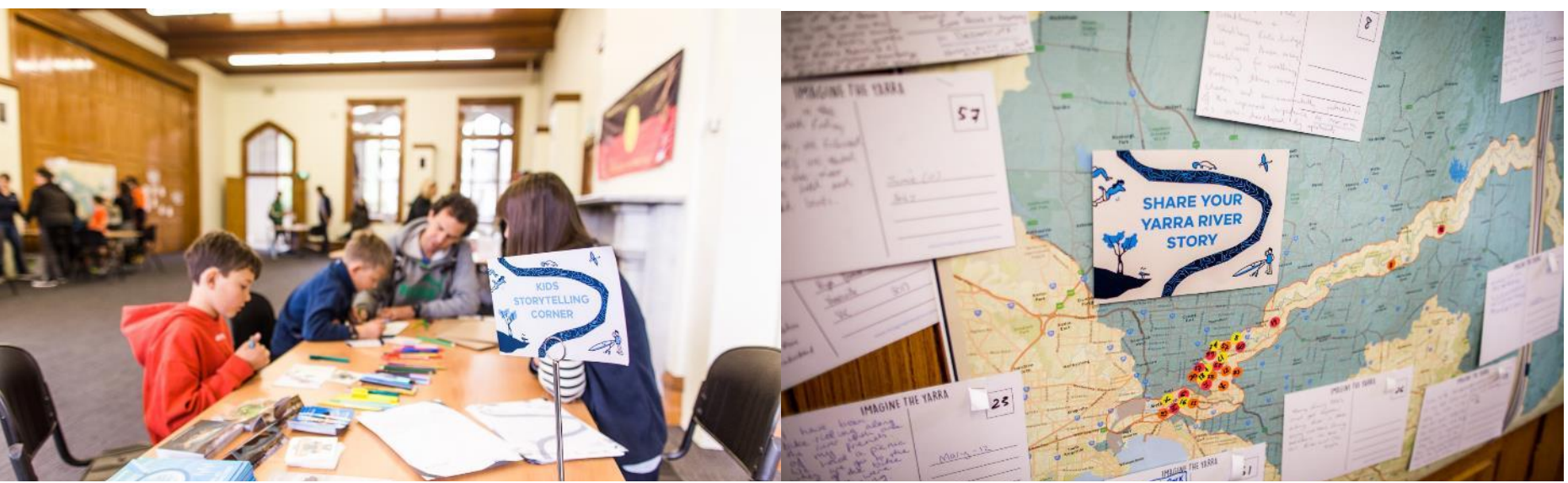
Yarra Stories Community Event, Abbotsford