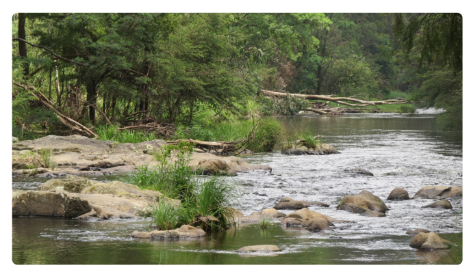
Figure 1. Yarra River at Warburton

In Victoria, compliance and enforcement in the non-urban water sector is carried out by the Minister for Water and water corporations like Melbourne Water.