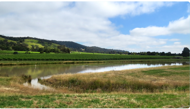
Figure 2. (Above) Irrigation dam in Yarra Valley