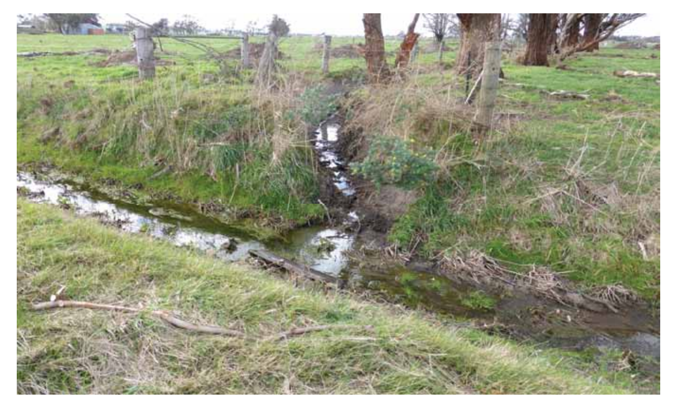
Private drain connecting into a precept drain

Landholders are responsible for providing stormwater drainage within their property boundaries and connections to the district drainage system. The proper maintenance of private drains is important to ensure that during wet weather events localised flooding is minimised on your land and on neighbouring properties.