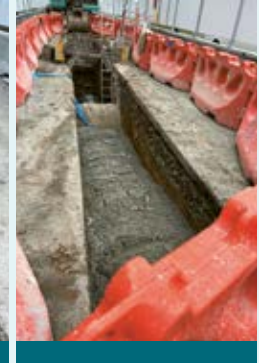
Figure 3. Backfill after pipe installation.