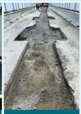
Figure 2. Preparation for asphalt reinstatement.