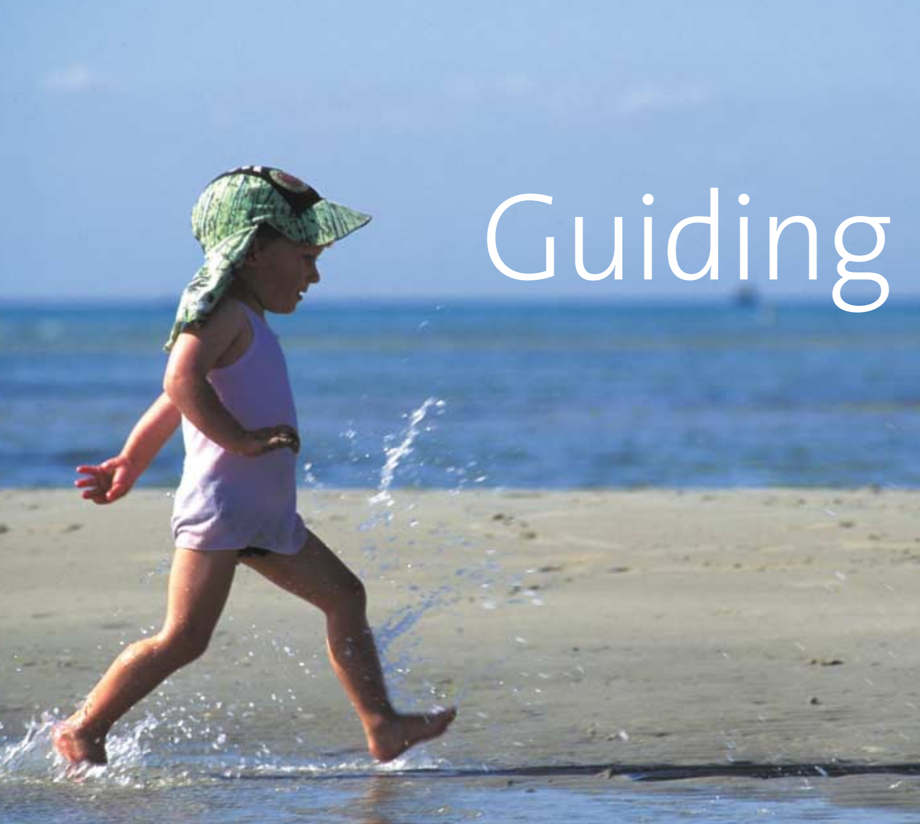
Fun in the sun: A young boy enjoys a splash at Rye ocean beach