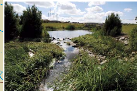
Water sensitive urban design - Wetland