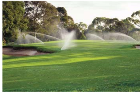
Recycled water use project