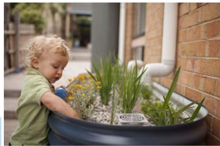
Water sensitive urban design - Community rain garden