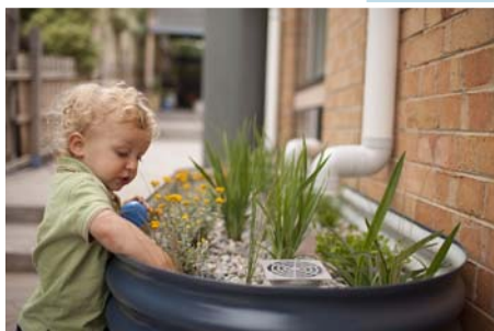
Water sensitive urban design - Community raingarden

Whilst all due skill and attention has been used Melbourne Water Corporation shall not be liable in anyway for loss of any kind including damages, costs, interest, loss of profits or special loss or damage, arising from any error, inaccuracy, incompleteness or other defect in this information. By receiving and accepting this information the recipient acknowledges that Melbourne Water Corporation makes no representations as to the accuracy or completeness of this information and ought carry out its own investigation if appropriate.