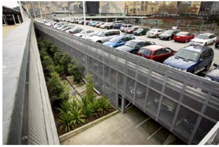
Water sensitive urban design - City raingarden