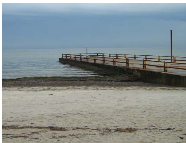
Original structure prior to demolition

The original structure was built 50 years ago to allow excess flows in Kananook Creek to discharge into the bay. Over the last few years most of the drain was repaired internally, but the final 60 metre section between the sand dunes and the bay had reached the end of its useful life and was beyond restoration.