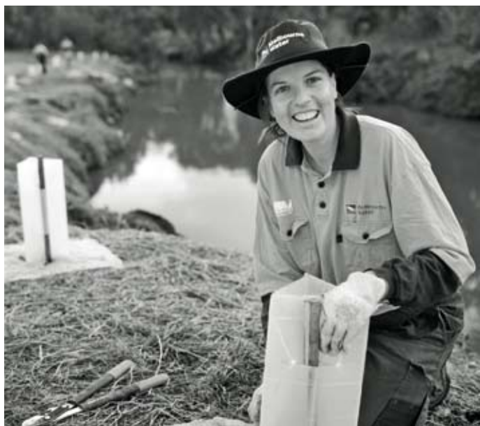
Top: Suburban raingarden Above: River health works, Merri Creek

The Myrning and Korkuperimmul Creeks Biolink Project is an example of one large and successful collaborative effort from this program. The project is developing two north-south biolinks, joining high biodiversity areas – Wombat State Forest and Werribee Gorge – by enhancing native vegetation and faunal habitat along the upper reaches of both creeks.